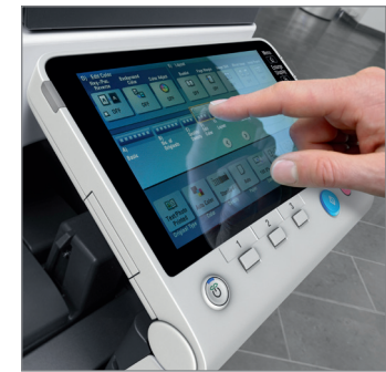
9" multi-touch display with 10-key pad (optional)

Integration with Active Directory or badge-based authentication ensure controlled access to printing and also provide the IT manager with important tools to monitor costs and cut paper and toner waste, for a more sustainable print environment. Secure use and respect for the environment, assisted by low TEC values.