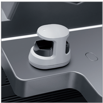
Advanced security options, multiple authentication systems